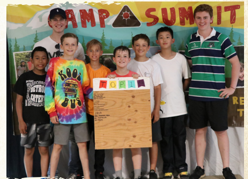
Diamond Head Atwell Tantalus Diamond Head Atwell