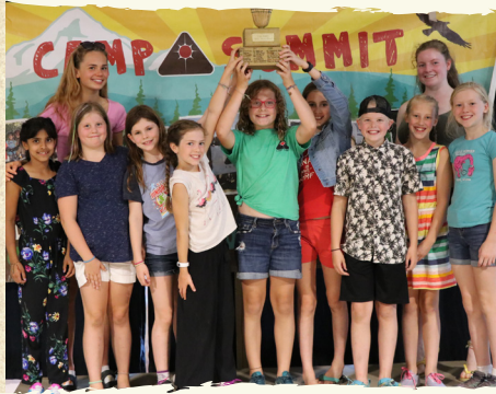
Jimmy Jimmy Sky Pilot x 4 Sessions Serratus Pelion Ashlu